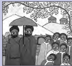
Gathering for the Holiday Challah Cover (with fringe)