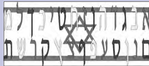
Aleph/Bet Wall Hanging (23" x 10")