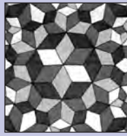
Gem Star Pillow Cover

* All NACOEJ addresses, phone numbers, etc. will be unchanged until further notice!