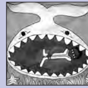
Jonah & the Whale Pillow Cover