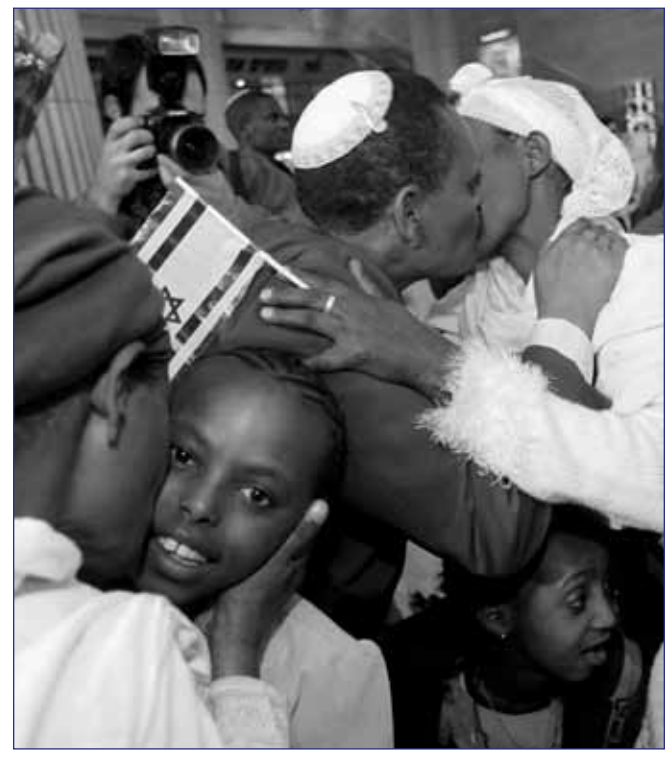
Family members in Israel are notified of family members arriving from Ethiopia, and are at the airport to greet them with the many, many hugs and kisses Ethiopians bestow at such tearful reunions. In some cases, the families had been separated for years.

<u>But</u> – the Israeli embassy in Addis Ababa – along with Israeli embassies all over the world – was on strike until a few days ago! (I'm told that even the ambassadors were striking, though I find that hard to believe.)