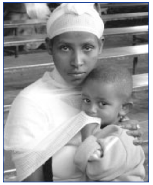
FEEDING CENTER OPEN -